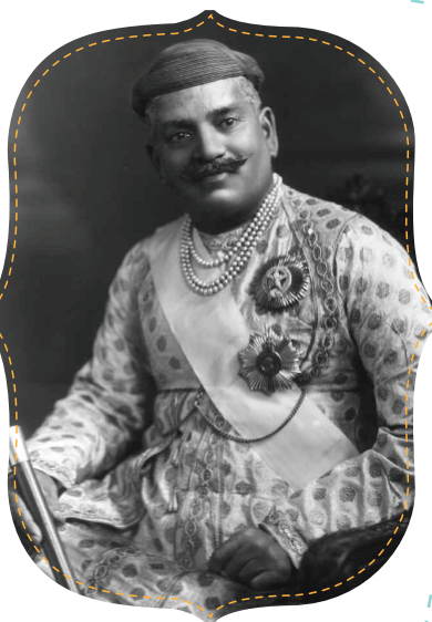
SAYAJIRAO III GAEKWAD, MAHARAJA OF BARODA, 1919

With its inclusion into the Smart City list, Vadodara (formerly known as Baroda) is now projected to become an 'innovative manufacturing hub' attracting investments from many MNCs and IT firms. Known for its university - particularly the faculty of Fine Arts, Engineering, English and Home Science - this city has been truly cosmopolitan, attracting people from across the country.